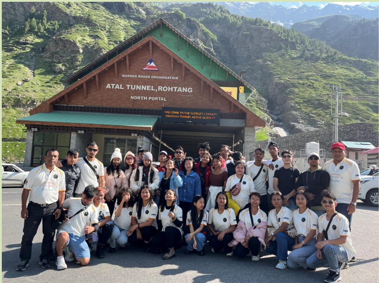
Figure 1: Rohtang Tunnel

Important Landmark: Brahmaputra River, Ganges River, Chenab River, Beas River, Yamuna River, Qutub Minar, Red Fort, India Gate, Taj Mahal, Vashist Hot Water Spring, Rohtang Pass, Gullaba, Kullu, Atal Tunnel, Solang Valley, Naggar Castle, Dhakpo Shedrupling Monastery