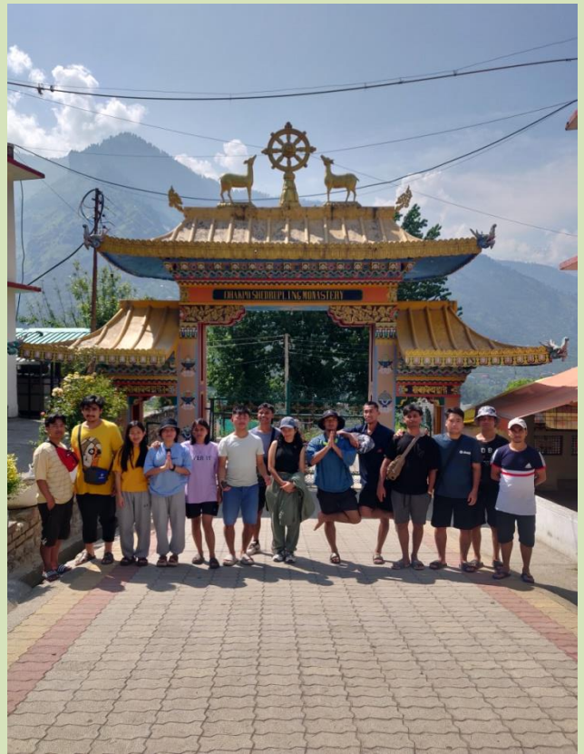
Figure: Dagpo Shedrupling Monastery, Kullu