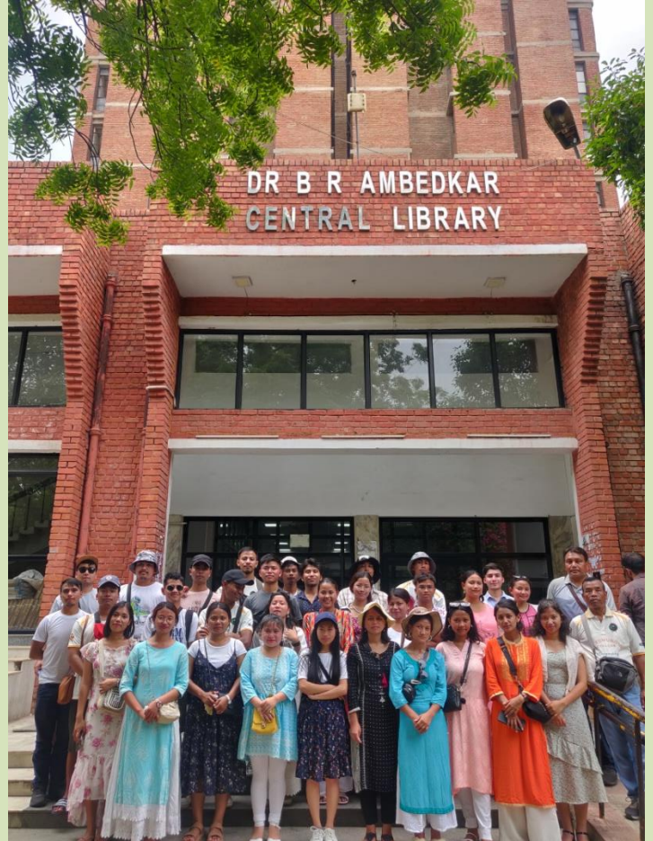
Figure 2: Central Library, Jawaharlal Nehru University, New Delhi