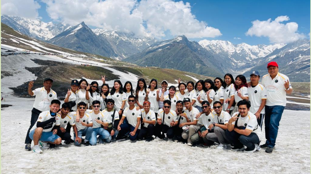
Figure 8: Rohtang Pass