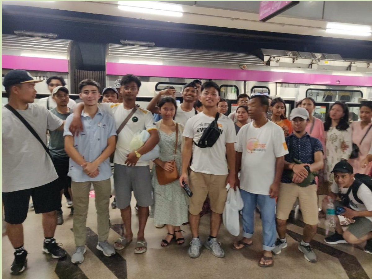
Figure 7: Delhi Metro