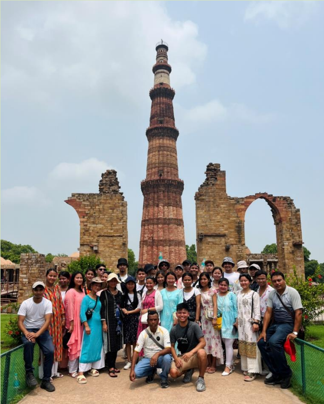
Figure 3: Qutub Minar, Delhi