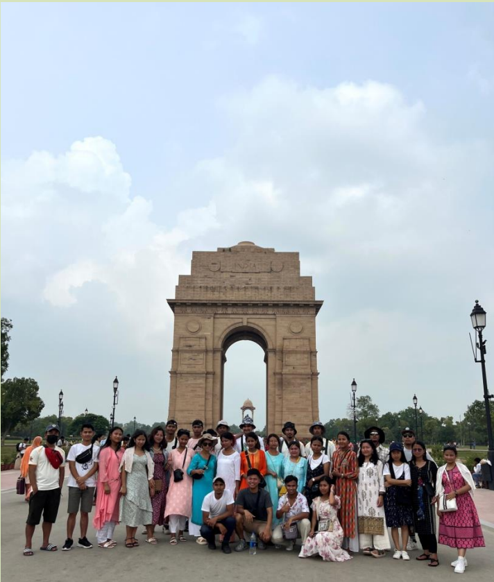
Figure 4: India Gate