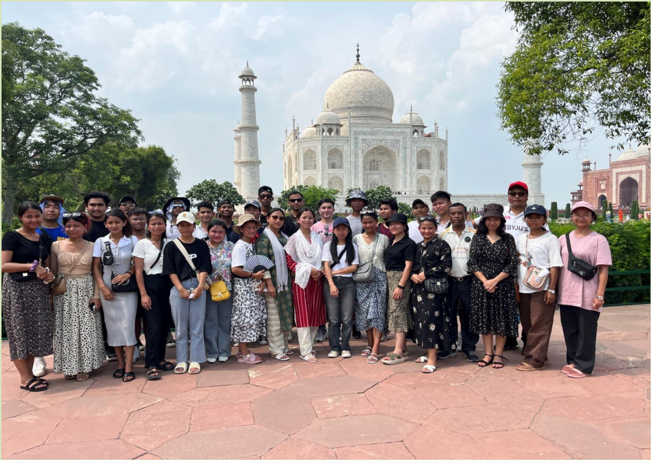
Figure 6: Taj Mahal, Agra