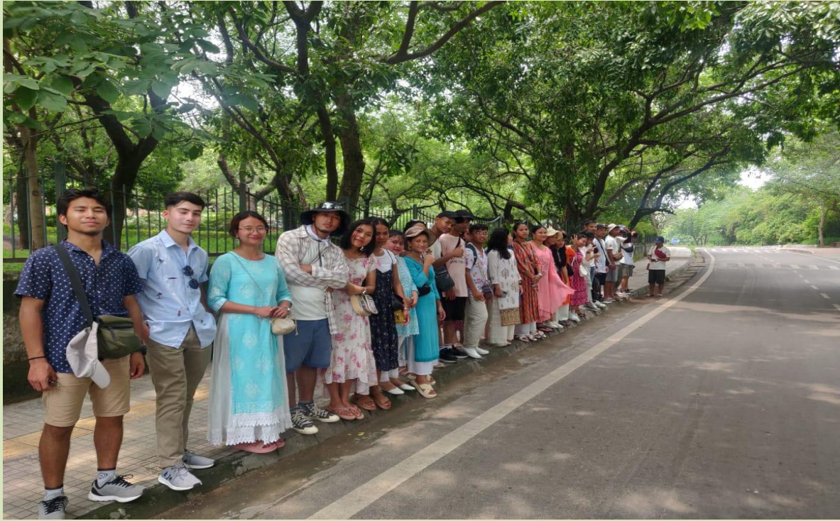
Figure 9: JNU Campus