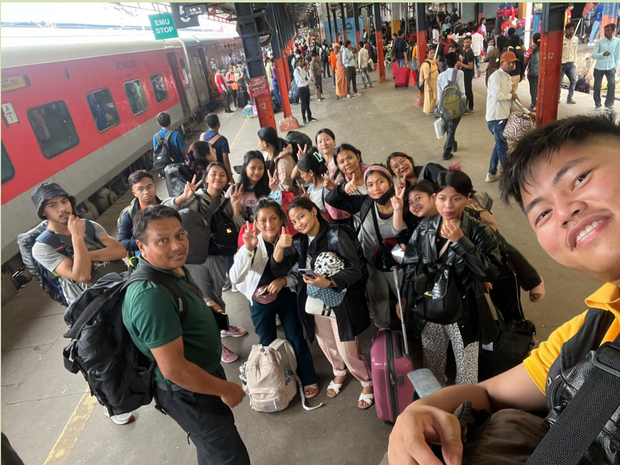
Figure 5: Old Delhi Railway Station