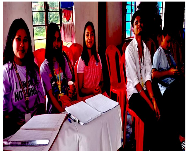
Photographs of student volunteers during the camp registration