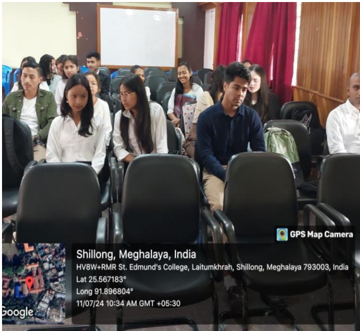
Photo1: Participants during the program