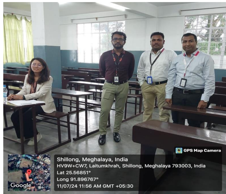
Photo2: Resource Persons, TCS group