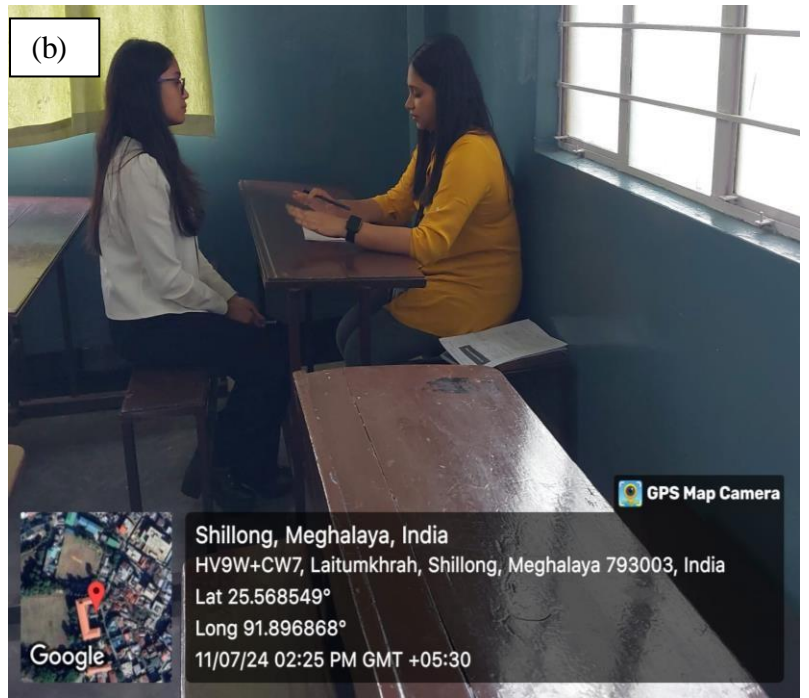
Photo5: Viva Session with the selected students