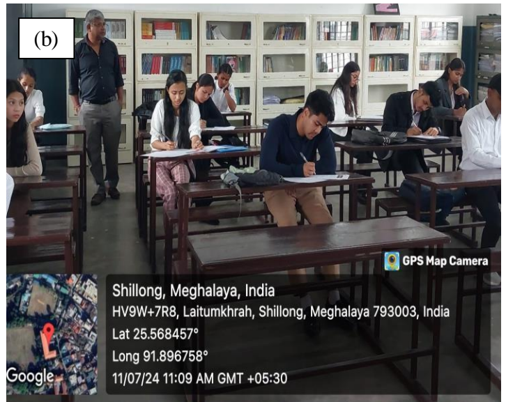
Photo4 (a)&(b):Assessment session