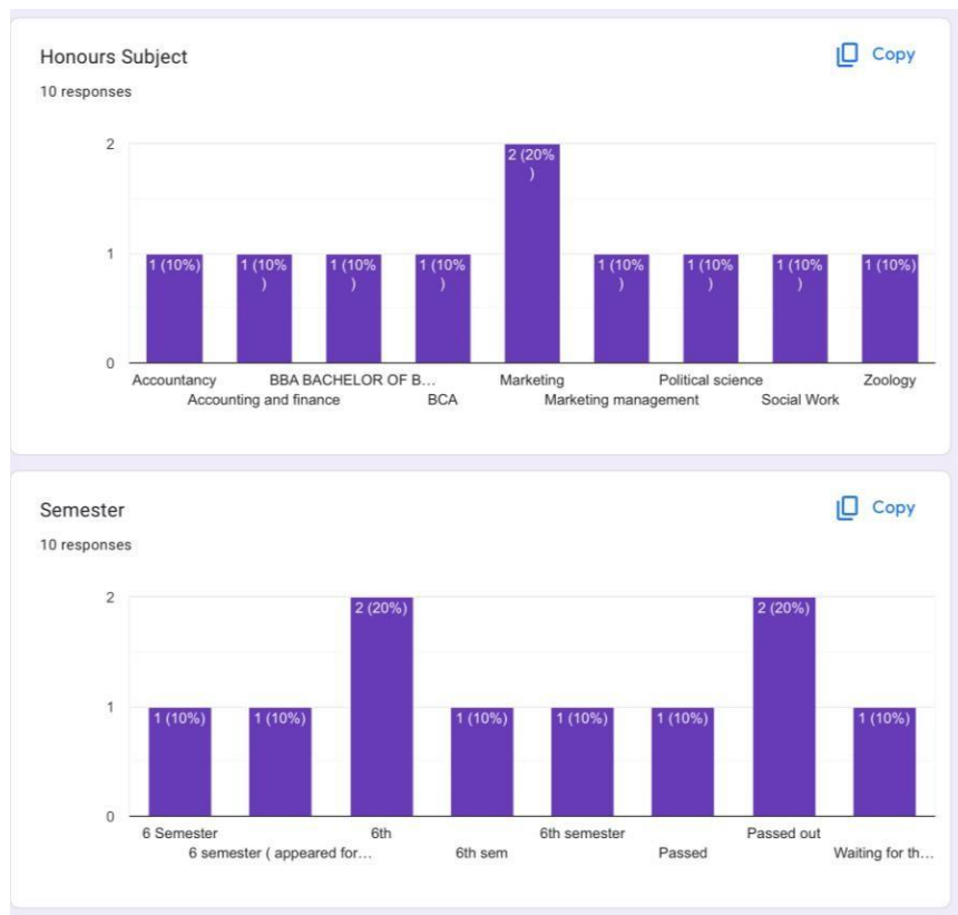
Fig: Graph showing the details of the participants

A total number of 16 students from various colleges attended the program. Most of the students included graduates from various subjects and some were still in their current 6 th semester. The following are the lists of the attendees of the said program.