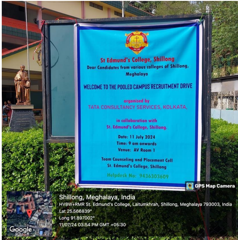
Photo: Program Information