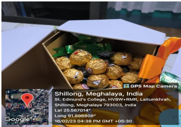
GPS Map Camera Shillong, Meghalaya, India St. Edmund's College, HV8W+RMR, Laitumkhrah, Shillong, Meghalaya 793003, India Lat 25.567014° Long 91.896808° 16/02/23 04:38 PM GMT +05:30 Google