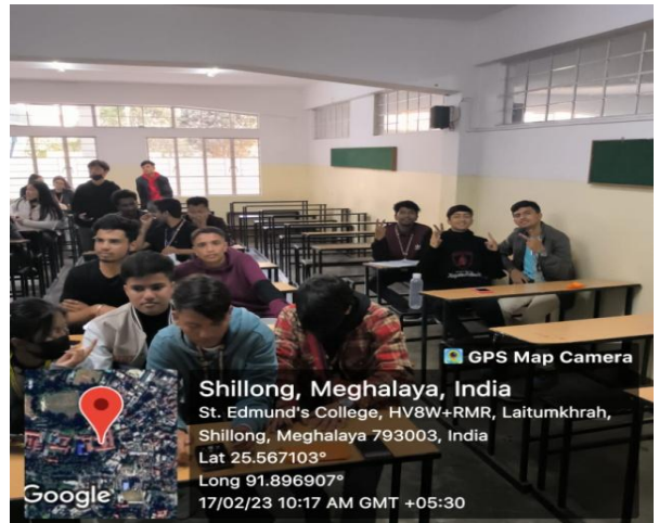
GPS Map Camera Shillong, Meghalaya, India St. Edmund's College, HV8W+RMR, Laitumkhrah, Shillong, Meghalaya 793003, India Lat 25.567103° Long 91.896907° 17/02/23 10:17 AM GMT +05:30 Google