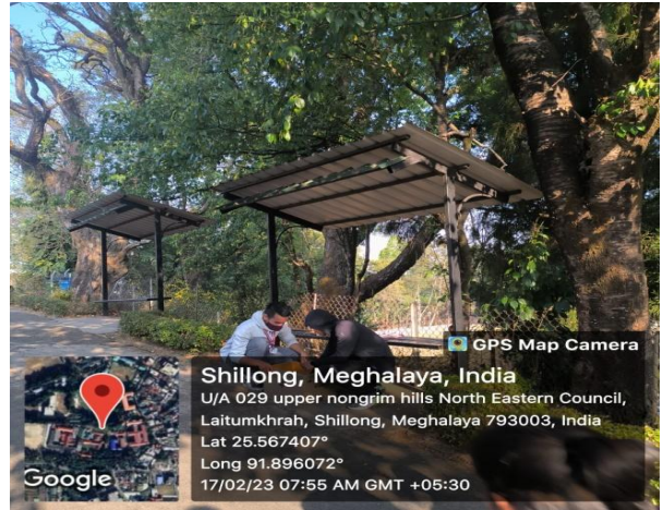
GPS Map Camera Shillong, Meghalaya, India U/A 029 upper nongrim hills North Eastern Council, Laitumkhrah, Shillong, Meghalaya 793003, India Lat 25.567407° Long 91.896072° 17/02/23 07:55 AM GMT +05:30 Google