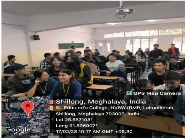
GPS Map Camera Shillong, Meghalaya, India St. Edmund's College, HV8W+RMR, Laitumkhrah, Shillong, Meghalaya 793003, India Lat 25.567103° Long 91.896907° 17/02/23 10:17 AM GMT +05:30 Google