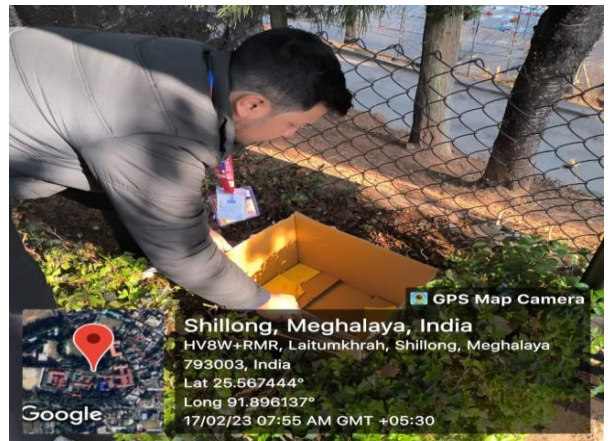
GPS Map Camera Shillong, Meghalaya, India HV8W+RMR, Laitumkhrah, Shillong, Meghalaya 793003, India Lat 25.567444° Long 91.896137° 17/02/23 07:55 AM GMT +05:30 Google