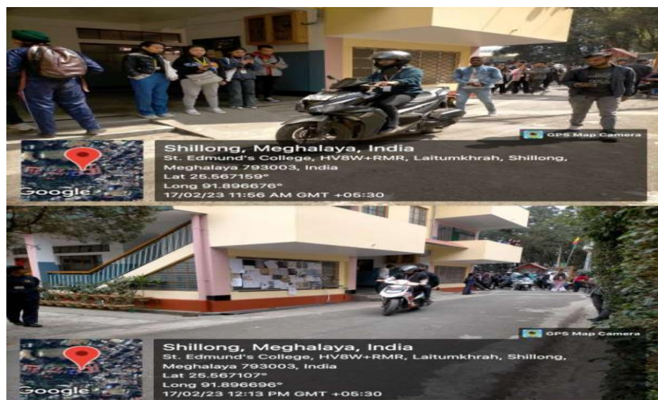
Report on Edblazon 2022- Two wheel Balancing