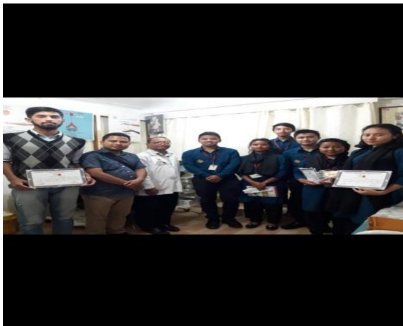
Blood Donation at Nazareth Hospital