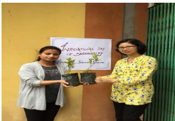
Distribution of Saplings for adoption

The programme concluded with a vote of thanks given by NSS PO E. Sumer, followed by a refreshing cup of tea and snacks.