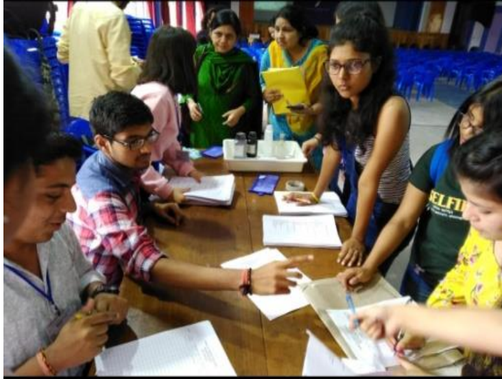
Counter for Blood profiling