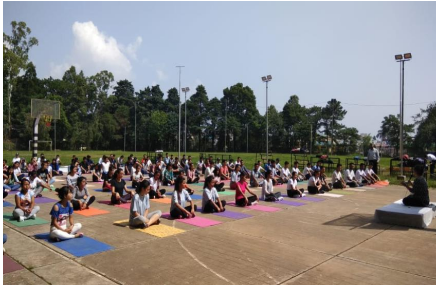
International Day on Yoga