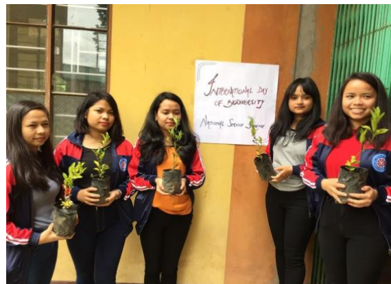
NSS volunteers with their saplings