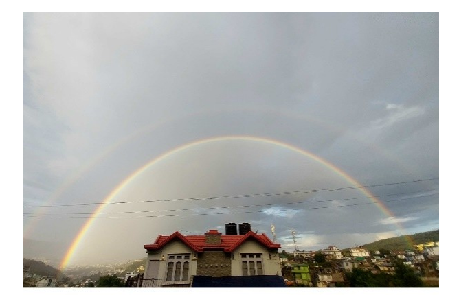
Behold the fleeting marvels of nature's hidden gems.