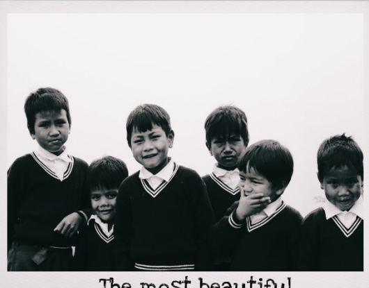
The most beautiful of all Life's Seasons!