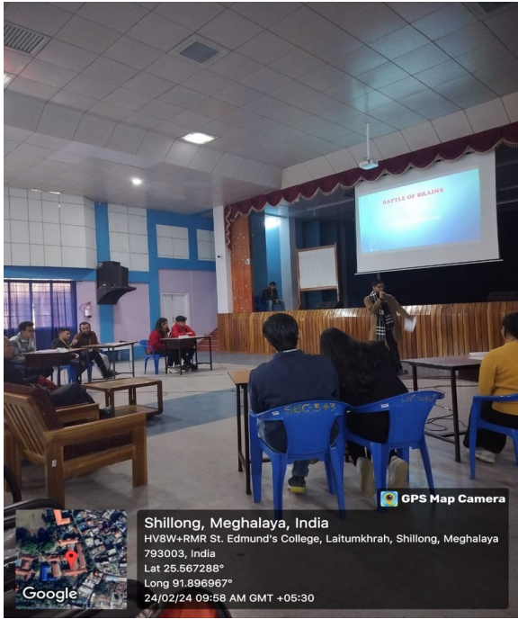
Shillong, Meghalaya, India HV8W+RMR St. Edmund's College, Laitumkhrach, Shillong, Meghalaya 793003, India Lat 25.567288° Long 91.896967° 24/02/24 09:58 AM GMT +05:30