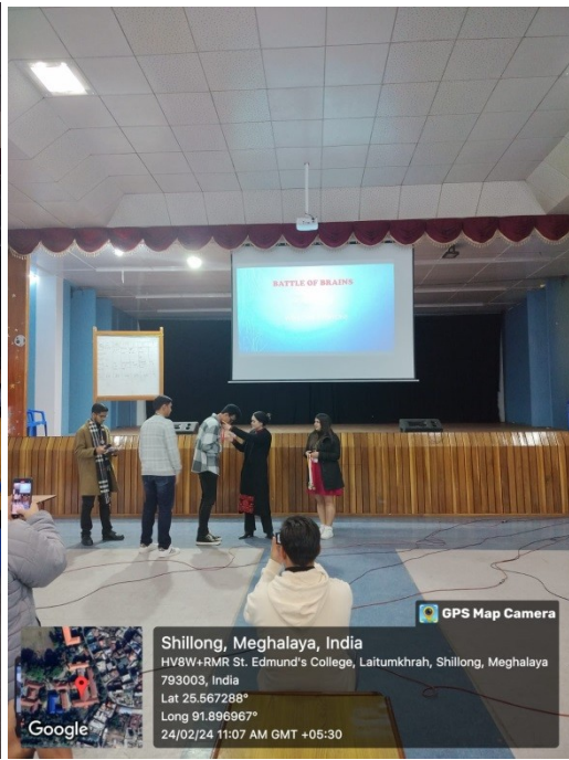
Shillong, Meghalaya, India HV8W+RMR St. Edmund's College, Laitumkhrach, Shillong, Meghalaya 793003, India Lat 25.567288° Long 91.896967° 24/02/24 11:07 AM GMT +05:30