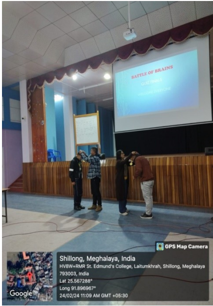
Shillong, Meghalaya, India HV8W+RMR St. Edmund's College, Laitumkhrach, Shillong, Meghalaya 793003, India Lat 25.567288° Long 91.896967° 24/02/24 11:09 AM GMT +05:30