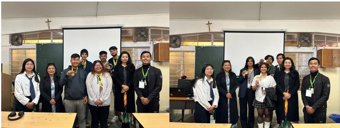
Participants along with Teacher's in charge , Animators and Volunteers: