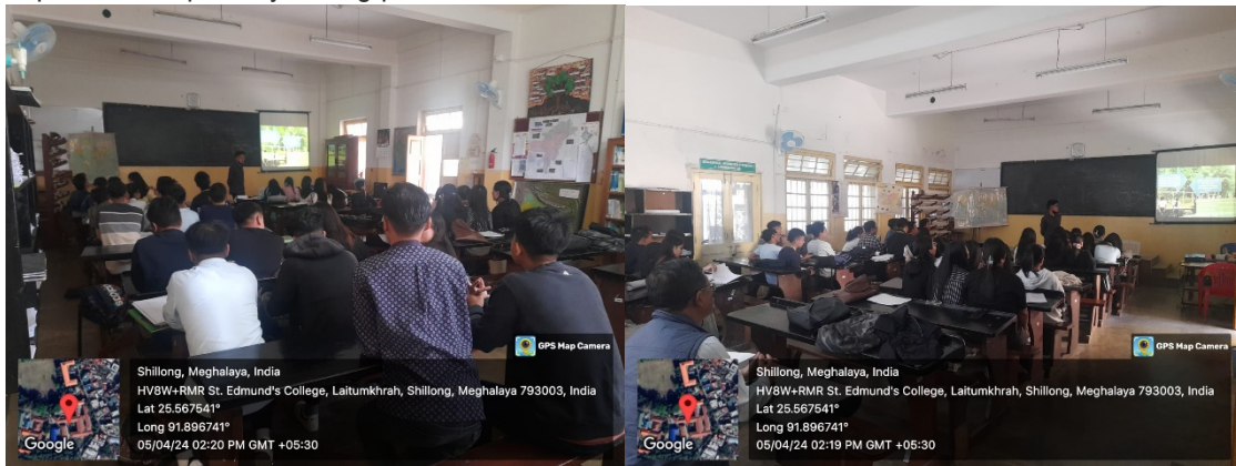
Figure 1 Experiential Learning

Participative learning and group learning is another method that help enhance students learning experience especially during practical classes.