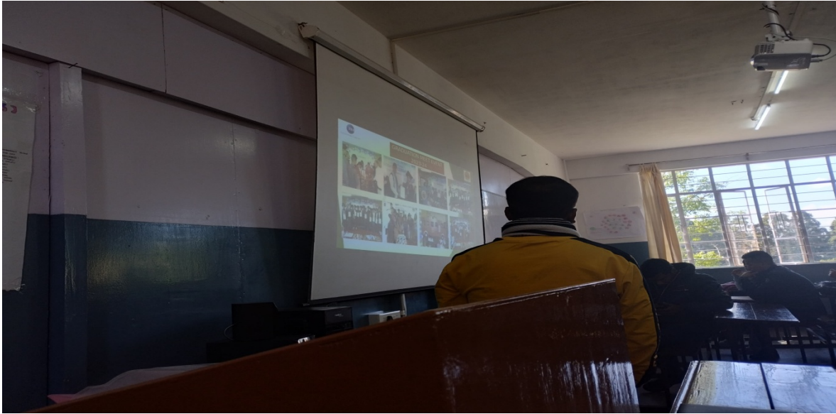
Microsoft Tools are being used as teaching aid for the students