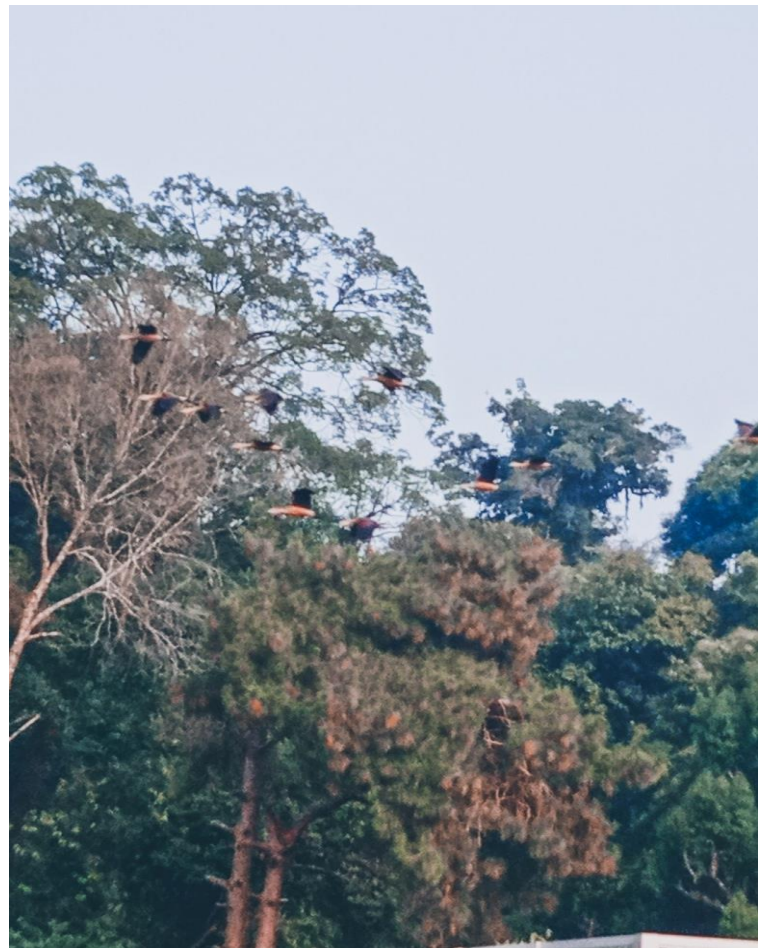
(This Photo was Capture in Jowai,Meghalaya on November 2020)

LESSER WHISTLING DUCK – The lesser whistling duck also known as Indian whistling duck or lesser whistling tesal , is a species of whistling duck that breeds in the Indian subcontinent and Southeast Asia. They are nocturnal feeders that during day may be found in flocks around lakes and wet paddy fields.