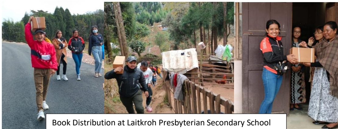
Book Distribution at Laitkroh Presbyterian Secondary School

On the 10 th December 2021, the MSW 3 rd students distributed 500 plus books given by well-wishers to the Laitkroh Presbyterian High School.