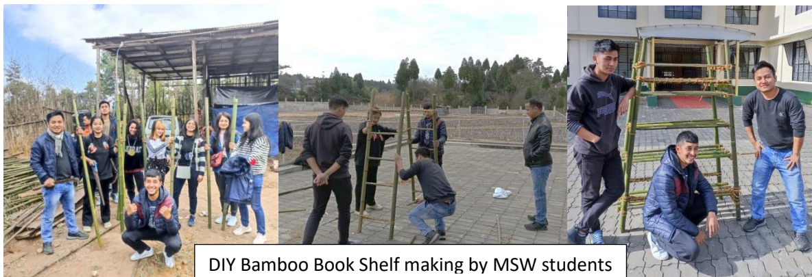
DIY Bamboo Book Shelf making by MSW students

On the 10 th of December 2021, the students had arranged with the local community few bamboos to make a Bamboo Book Shelf for St. Peter Lower Primary School. A few students spend their morning hours to make it by themselves. This showed the love and passion they have to give back to the community in any way that they can.