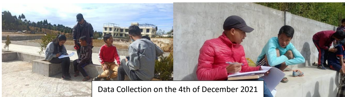
Data Collection on the 4th of December 2021

On the 10 th December 2021, the faculty members had arranged with the Principal of St. Peter's Higher Secondary School to collect the data for the study from the High School students. They were given one period to collect the data and 26 MSW students with faculty members and each student have to monitor and assist each bench if the students have any clarification.