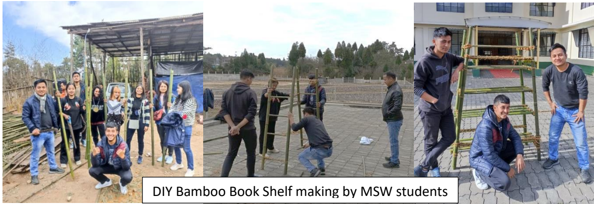
DIY Bamboo Book Shelf making by MSW students

After making the Bamboo Book Shelf, the students went and distributed 850 plus books to the school. The books were kept at the staff room and were received by the teacher of the school.