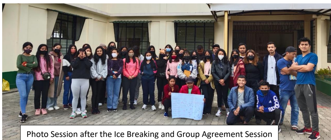
Photo Session after the Ice Breaking and Group Agreement Session

In the second activity, the student social workers simply introduced themselves one by one. After the Ice Breaking Sessions the group was divided into three sub groups, and were asked to list out 10 rules that each member has to follow during the whole 4 days of fieldwork. After each group listed the 10 rules, they came up with a Group Agreement that will enhance their effective performance. All the students then put in their signature as a sign of agreement to work as a team and respect one another.