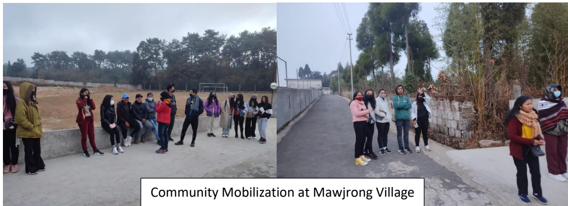
Community Mobilization at Mawjrung Village

On the 3 rd of December 2021, the student social workers separated into groups and went to different lanes around the community to mobilize. They went door to door to inform people in the community to attend the focus group discussion the next day: for parents at 8:00 am and for teachers and students starting from 10:00 am. On the 4 th of December 2021, the student social workers walked around the village at 8:00 am to mobilize the parents to attend the FGD in the village community hall.