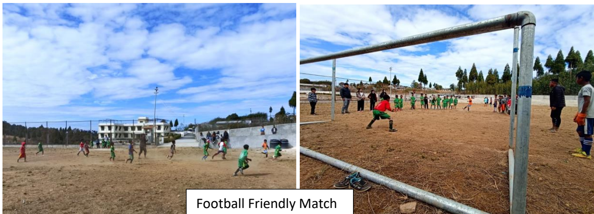
Football Friendly Match

A Football Friendly Match was organized by the MSW 3 rd semester students on the 4 th of December 2021. The main objective of organizing this football match was to build rapport with the children of the village. There were two students who took charge of the football match. These children participants came from Mawjriong, Dympep and Laitkroh Villages.