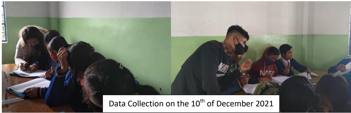
Data Collection on the 10 th of December 2021

All together 100 respondents were selected randomly for the study.