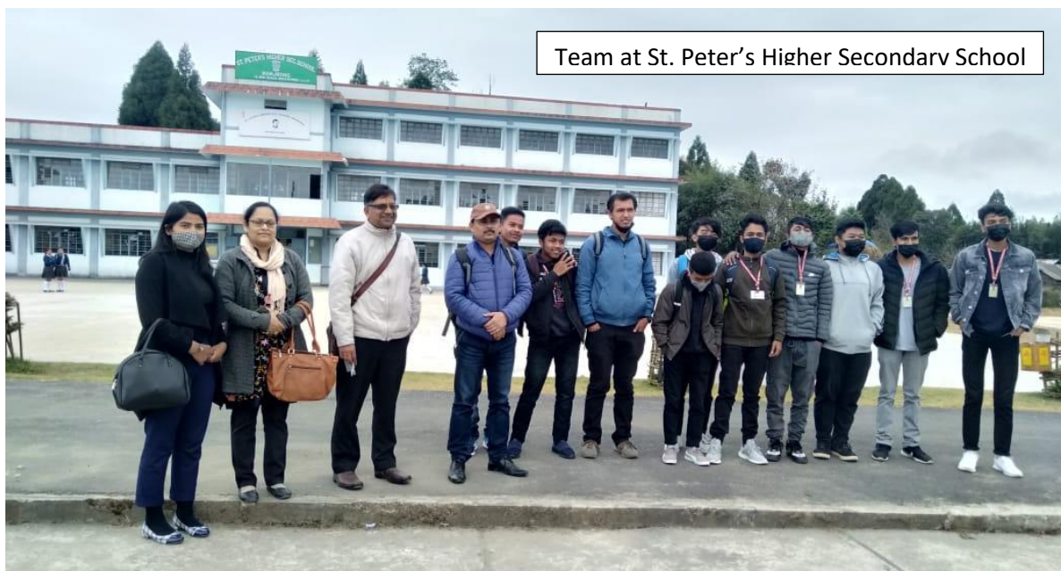
Team at St. Peter's Higher Secondary School