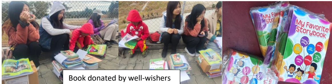
Book donated by well-wishers

The student social workers who were part of the book bank committee, organised a pile of books to set up a community library for the children in Mawjrong village. The student social workers and teachers largely contributed children's books in the Book Bank Campaign.