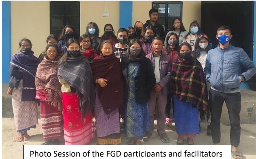
Photo Session of the FGD participants and facilitators

Network is a major problem for them. Some students who really want to study had to go to their friend's place to ask for a phone/mobile so that they can get the notes.