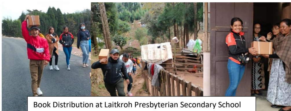
Book Distribution at Laitkroh Presbyterian Secondary School

On the 10 th December 2021, the MSW 3 rd students distributed 500 plus books given by well-wishers to the Laitkroh Presbyterian High School.