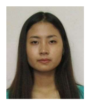
MALSAWMKIMI 8<sup>th</sup> BIOTECH