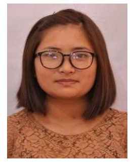
C LALNUFELI 2<sup>nd</sup> ZOOLOGY