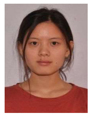
RATA THUPITOR 5<sup>th</sup> SOCIOLOGY