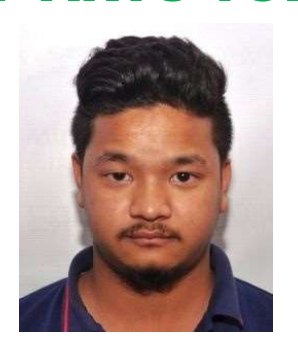
STRONG PILLAR KHARSOHNOH 9<sup>th</sup> GEOGRAPHY