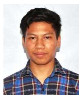
DAMANLANGKI PALE 9<sup>th</sup> MATHS