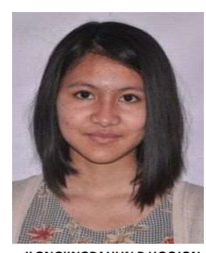
ILONGIINGBAHUN B HOOJON 3<sup>rd</sup> SOCIOLOGY