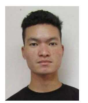
JUMKU BUI 2<sup>nd</sup> MATHS