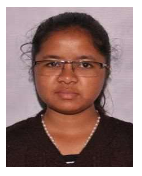
MEDAAISHISHA WARBAH 8<sup>th</sup> BIOTECH