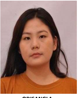
ODISANGLA 2<sup>nd</sup> ENGLISH