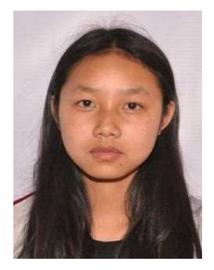
THEMSHINGMI KATHING 8<sup>th</sup> HISTORY