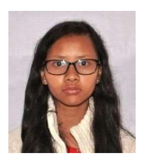
PRETTY WAR 8<sup>th</sup> EVS