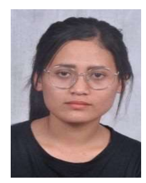
HOINEIVAH BAITE 7<sup>th</sup> SOCIOLOGY