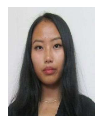
LALRUATZELI 10<sup>th</sup> HISTORY