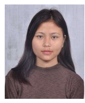
HOINGAILHING HAOKIP 9<sup>th</sup> POLITICAL SC