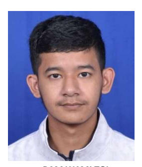
RAM WAMI TOI 10<sup>th</sup> CHEMISTRY