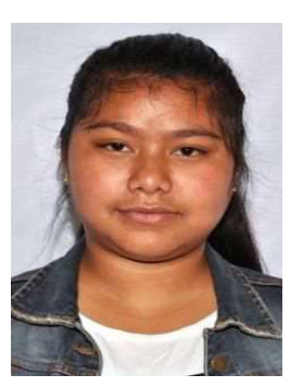
BALARIHUN NONGMIN 3<sup>rd</sup> BIOCHEM