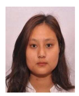
IMLIKOKLA AIER 4<sup>th</sup> ENGLISH