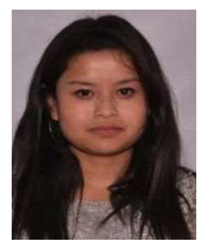
ILAWANDASHISHA LASO 10<sup>th</sup> BIOTECH