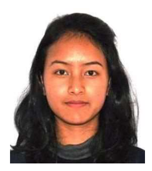
10<sup>th</sup> COMP SC