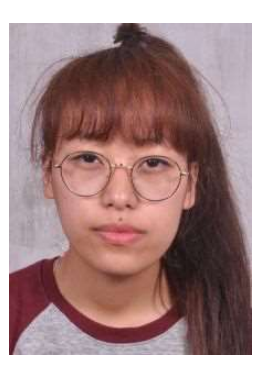
VIMHAZONU SOTHU 9<sup>th</sup> BCOM