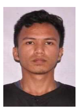
HA U MI DEWAN MUKHIM 10<sup>th</sup> BIOTECH