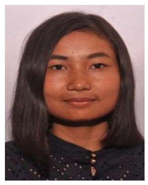
RUVUOPHRENUO SORHIE 6<sup>th</sup> SOCIOLOGY