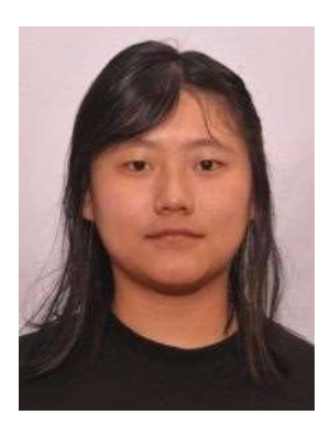
VISAKHONUO KULNU 1st POLITICAL SC