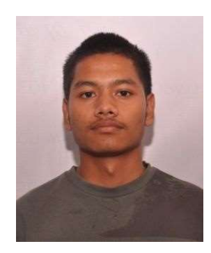
PARHAM LANGTHASA 7<sup>th</sup> GEOGRAPHY