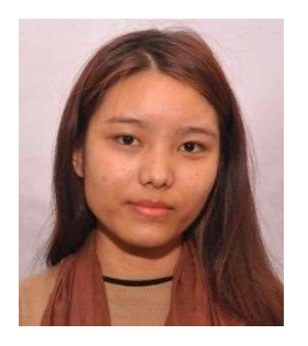
SOYALE MAGH 8<sup>th</sup> ECONOMICS