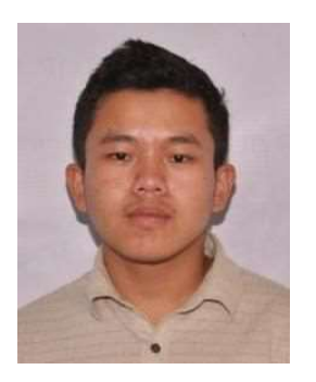
POUCHUNGONG GANGMEI 5<sup>th</sup> MATHS