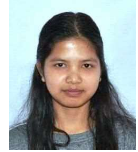
DA I HUN SHISHA SUPOOH 7<sup>th</sup> BOTANY