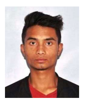
DAMUTSKHEM BIAM 8<sup>th</sup> ELECTRONICS