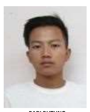
PADI BUTUNG 9<sup>th</sup> POLITICAL SC