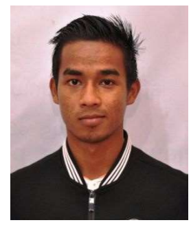
BANRIKMENLANG I SHYLLA 1<sup>st</sup> GEOGRAPHY