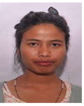
RITIFUL KHARKONGOR 5<sup>th</sup> HISTORY