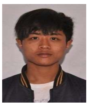
LALCHAWIMAWIA 7<sup>th</sup> POLITICAL SC