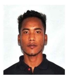
KMENLANG MAKRI 5<sup>th</sup> ELECTRONICS