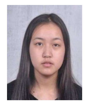
B LALNUNZAWMI 2<sup>nd</sup> HISTORY