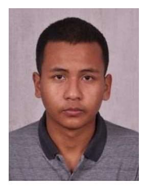
MEBANSHANBOR SUTNGA 1<sup>st</sup> BOTANY