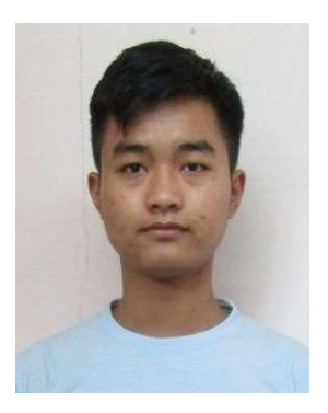
LALCHAWIMAWIA 8<sup>th</sup> PHYSICS