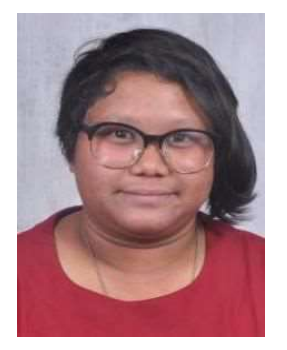
EUNICA PYNTNGEN TOHTIH 6<sup>th</sup> BIOTECH