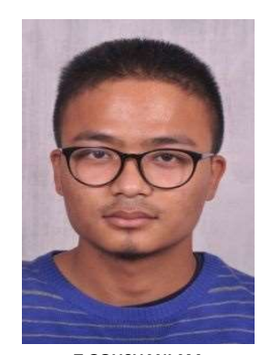
T GOUSUANLAM 7<sup>th</sup> HISTORY