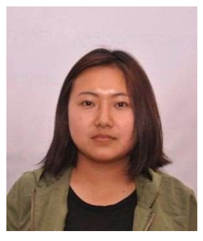
KOVELU LOHE 8<sup>th</sup> POLITICAL SC