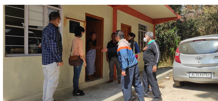
Mylliem Rngi LP School