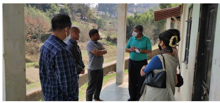
Mylliem Kyndong Nongkyntir LP School